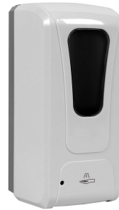
HS Temperature Dispenser

Dimensions: 4.9"W x 10.5"H x 4.0"D Touchless IR Sensing Sensing Distance - 3-4.5" 38mm Mouth Top - Easy Filling - Key Lock Includes: Mounting Screws Capacity: 1000ml (33.8 oz) Delivery: Spray 1ml - Fixed Batteries: 4 x "C" Cells Battery Life: 30,000 cycles